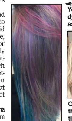
You can get your hair dyed a mix of blue of pink as well