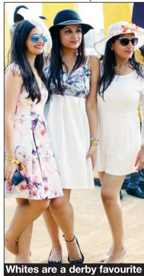
Whites are a derby favourite