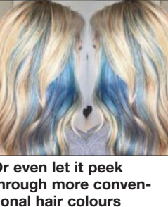
Or even let it peek through more conventional hair colours