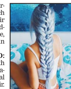
There's a new hair-colour trend on social media: #MermaidHair