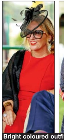
Bright coloured outfits and hair accessories made heads turn