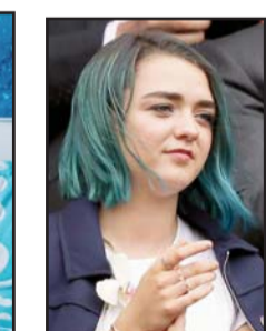
GoT star Maisie Williams is the latest celeb to sport the trend